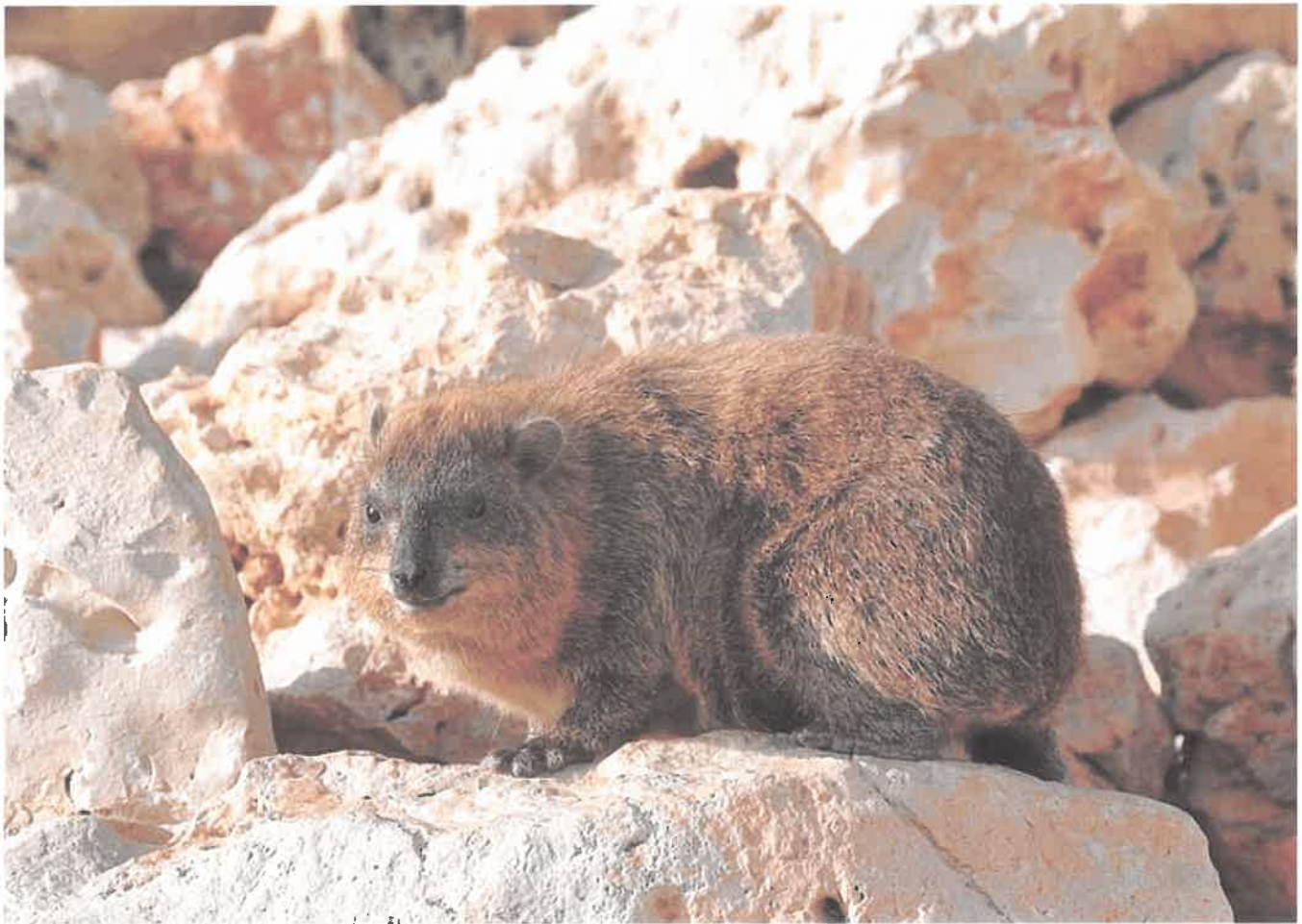
An Israeli Coney - Found In The Rocks Of Mountains and Canyons

foot. That is a long way from $20K per sq. ft. You will find out why the structure cost so much as we go along.