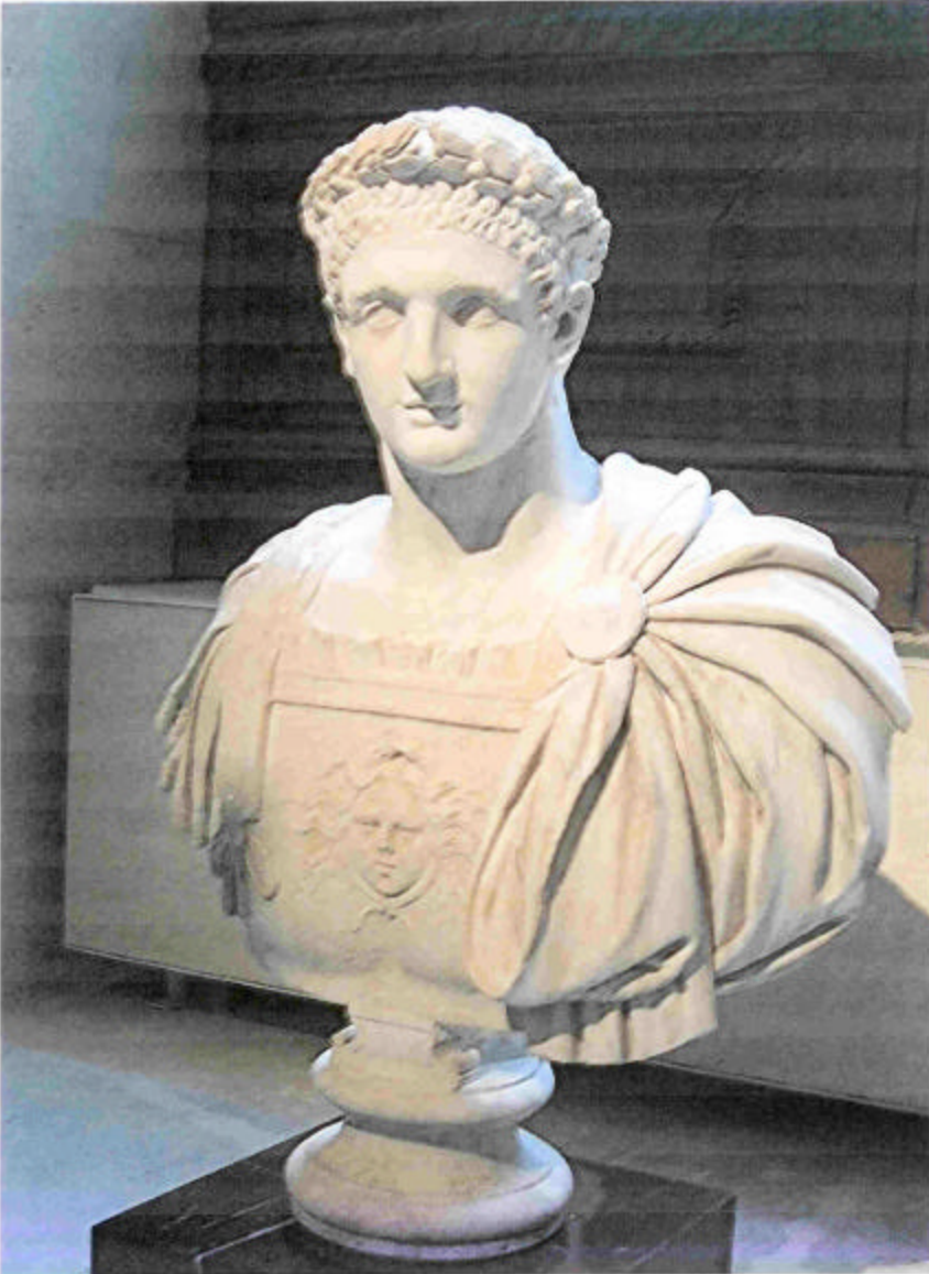
DOMITIAN BUST IN THE LOUVRE

The Apostle John was arrested and exiled to the Island of Patmos under the brutal and bizarre administration of Emperor Domitian. His own life was a mess as he was a womanizer and playboy. Toward the end of his reign, he developed a cruel personality. Jews and Christians alike were hounded. Domitian developed a paranoid fear of persecution that led him to kill or execute those he felt stood in his way. This included the Apostle/Pastor John who was ministering in Ephesus. John was banished to Patmos. In A.D. 96, Domitian was murdered in a plot organized by his enemies in the Senate. He was succeeded by Nerva, a relatively good man under whom John was released. Previous emperors had not insisted upon “emperor worship.” When insane Caligula